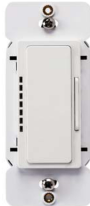
Suitable for Indoor Use Only